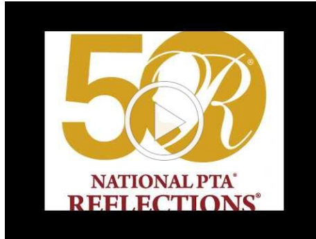
2019 Reflections Call for Entries

For more information, please view this video clip