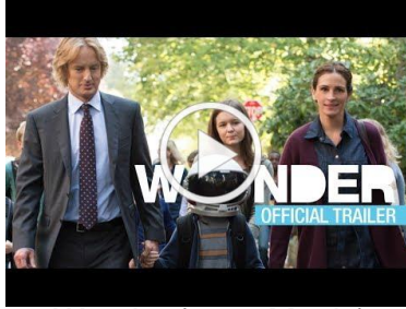
Wonder (2017 Movie) Official Trailer -

We encourage all children to read the book before the movie! "We are all Wonders" - RJ Palacio (Picture books for K-2) "Wonder" - RJ Palacio (Novel for independent readers)