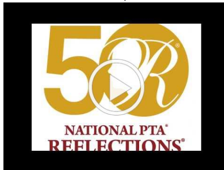
2019 Reflections Call for Entries

For more information, please view this video clip