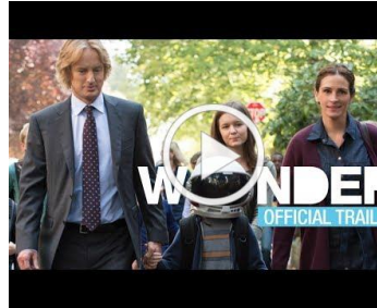
Wonder (2017 Movie) Official Trailer -