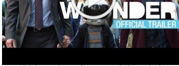
Wonder (2017 Movie) Official Trailer -

We encourage all children to read the book before the movie! "We are all Wonders" - RJ Palacio (Picture books for K-2) "Wonder" - RJ Palacio (Novel for independent readers)